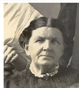
This is a picture of the center person in the photo above and right.