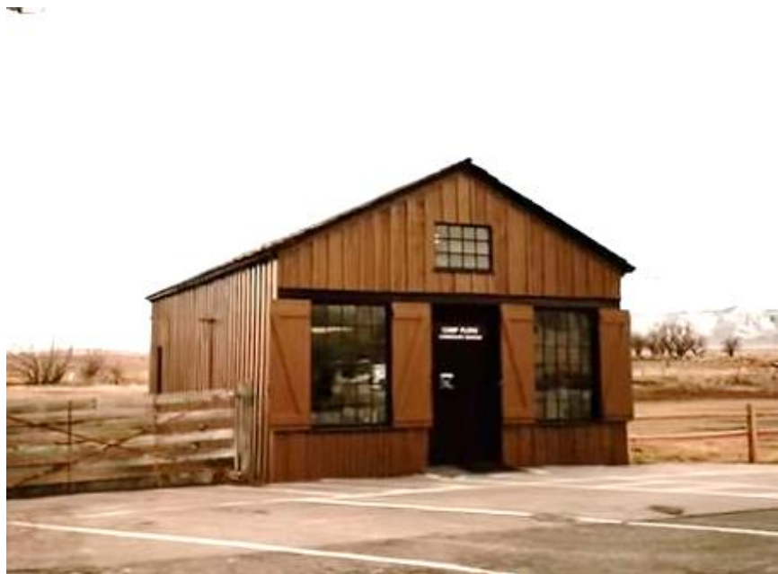
The Last remaining army building at Camp Floyd: the Commissary

“Used as a strategy by both the Northern and Southern States, Camp Floyd and the Utah War were an attempt to divert the nation’s attention from the issue of states rights and slavery, to the Mormon problem and