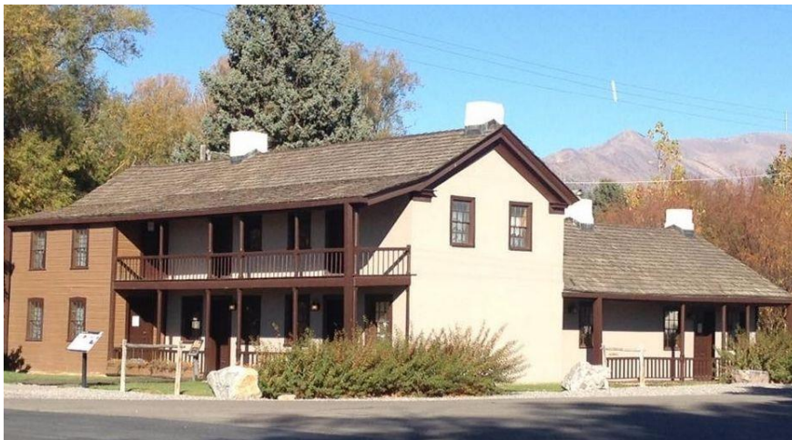
The Stagecoach Inn served customers until 1949

“Constructed in 1858 by the soldiers of Johnston’s Army, the Commissary Building served as a store of military equipment and provisions. It was sold to the Beardshall Family at auction in 1861, when the army was recalled for the Civil War. The building was relocated to its current site where it was used as the family’s home in Fairfield. All other camp buildings were either sold, dismantled or destroyed. Today, the Commissary Building serves as the Camp Floyd museum.